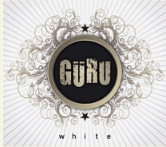
White ( 2013 )