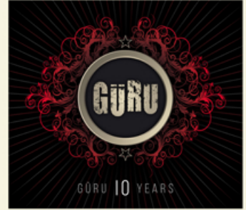
10 Years ( 2021 )